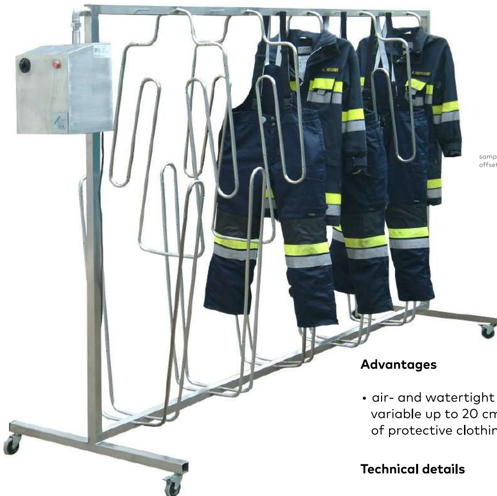
sample picture: OSMA Fireman for 5 jackets and trousers offset arrangement for jacktes and trousers