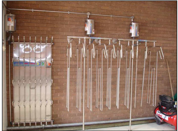
The Maritime Rescue Centre Nailsea – Avon UK