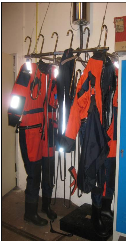
KLPD Willemstad, NL River Police