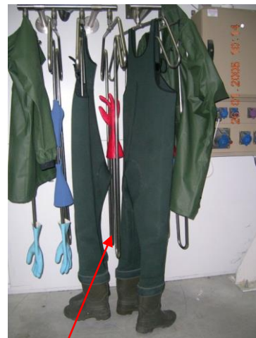
Drying hanger AT01LAW , standard.