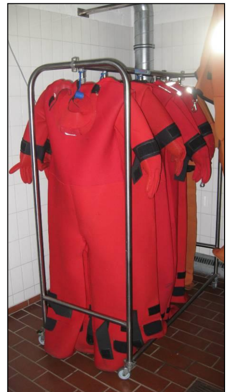
Deutsche Seemannschule Travemünde, DE